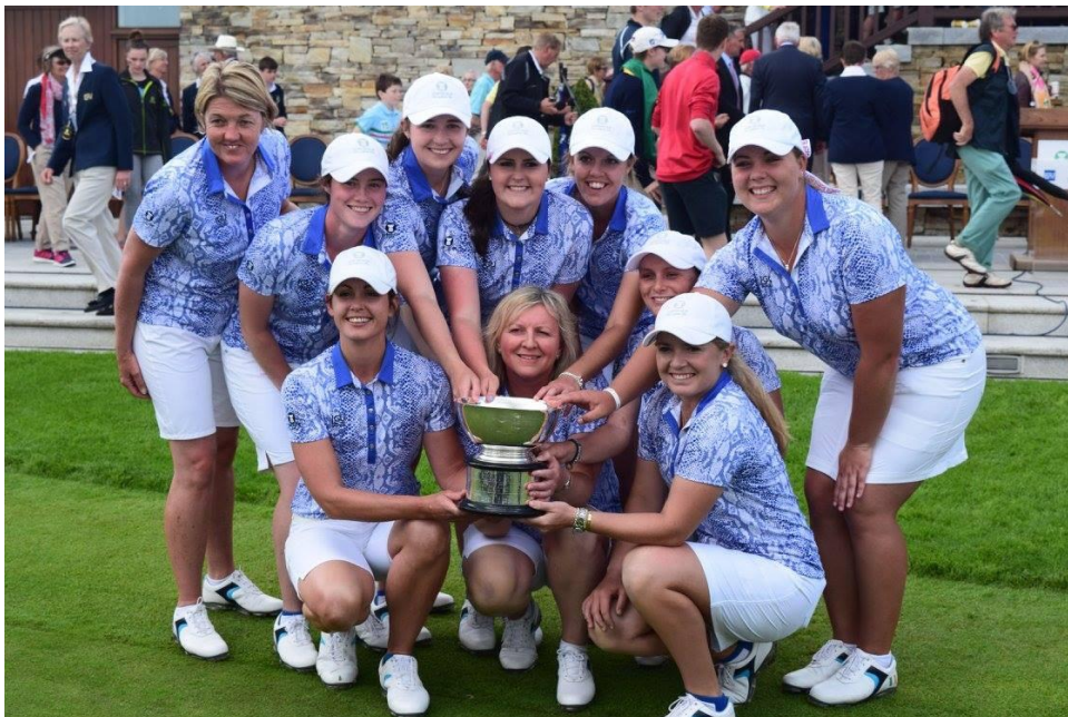
The winning GB&I team with the trophy after the Sunday's singles finished

This was a truly great experience for me to be involved directly with the team each day and also having the opportunity to make my contribution to the play of my two players, who went on to win 3 and 2 points respectively. I thought this point's haul was very credible against some tough opposition and I'm sure their play in the event will now propel them both to bigger and better things in the future.